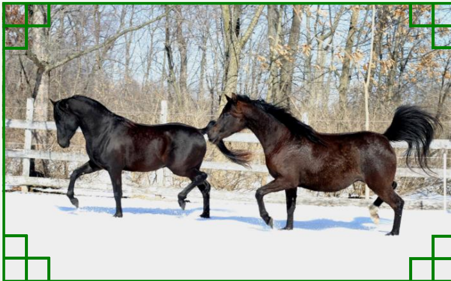
FA Afternoon Delight and KA Ladyblack frolic in the snow in the pastures of Ferin Arabians.